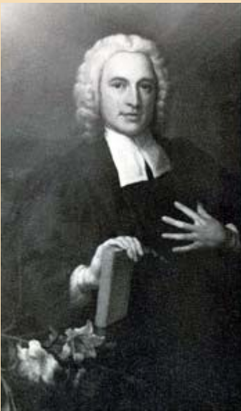
Charles Wesley (1707 - 1788)

Following this experience, John and Charles, with others, set about to stir up in others a like awareness of and response to the saving love of God. Of the two, John was the more powerful preacher, and averaged 8000 miles of travel a year, mostly on horseback. At the time of his death he was probably the best known and best loved man in England.